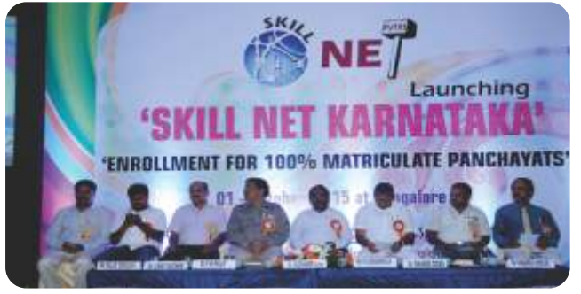
Dignitaries during the meet