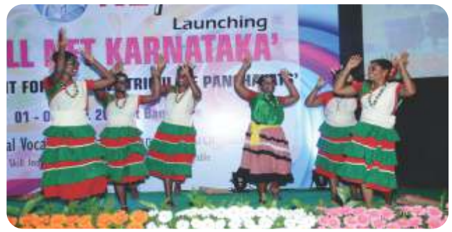
Cultural programme by the partners